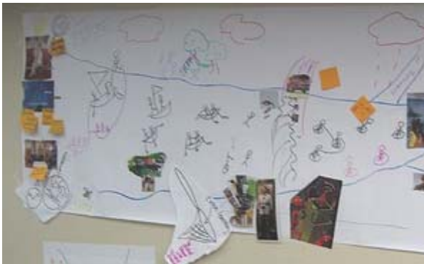
River of Life

( http://www.km4dev.org/wiki/index.php/Wikis ), blogs ( http://www.km4dev.org/wiki/index.php/Blogs ), social bookmarking and tagging ( http://www.flickr.com/photos/cambodia4kidsorg/sets/72157594548229100/ and http://nptech.info/ ) and other online tools. http://www.km4dev.org/wiki/index.php/CARE_Knowledge_Sharing_Workshop ).